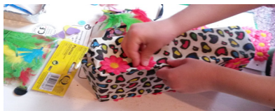
3. Decorate your float with flowers or other materials of your choice