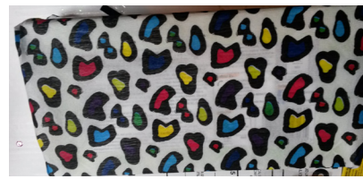
2. Wrap it with colourful craft paper