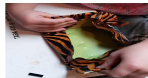
4. Add different levels to your float by cutting a shoe box lid