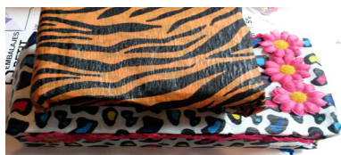
5. Attach the second level with glue